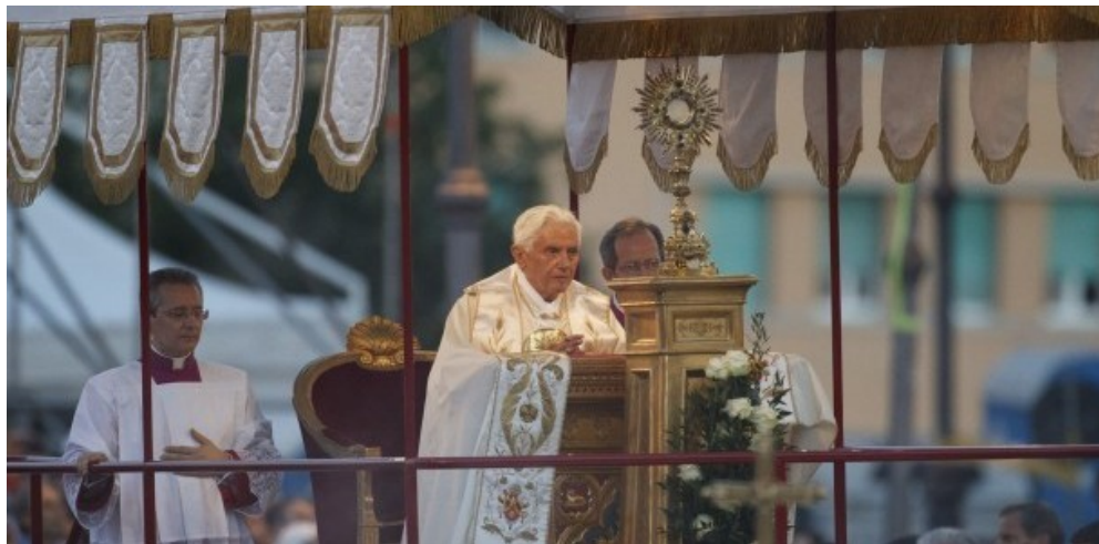
Pope Benedict XVI during the Eucharistic Procession in Rome on June 7, 2012

There will be only one Mass on the morning of Sunday, June 11. It will be at St. Gregory Church at 9:00 AM.