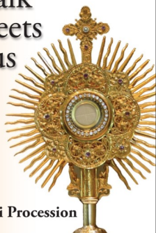
Corpus Christi Procession